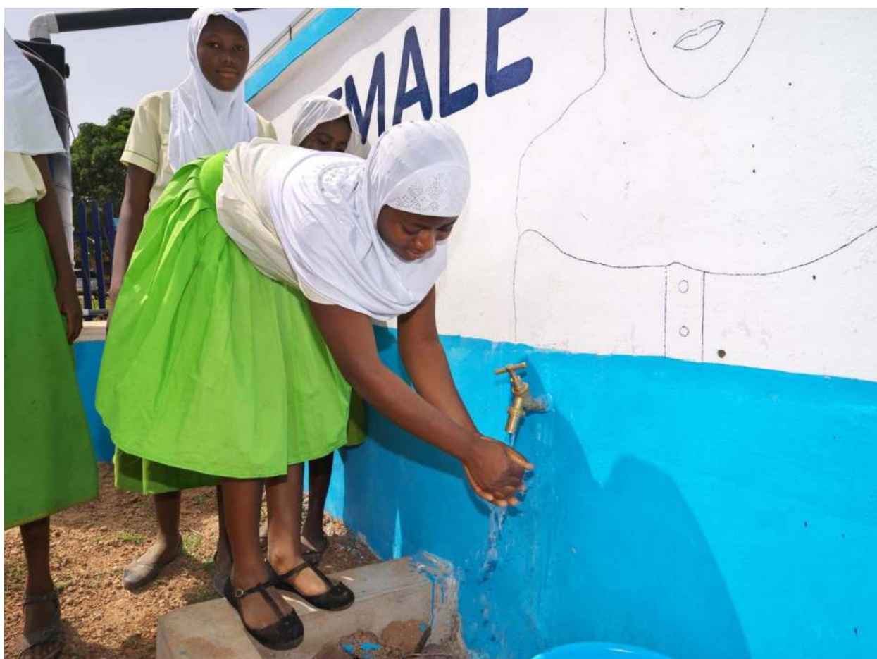
Girl students use a new school latrine in Tamale in Northern Ghana.