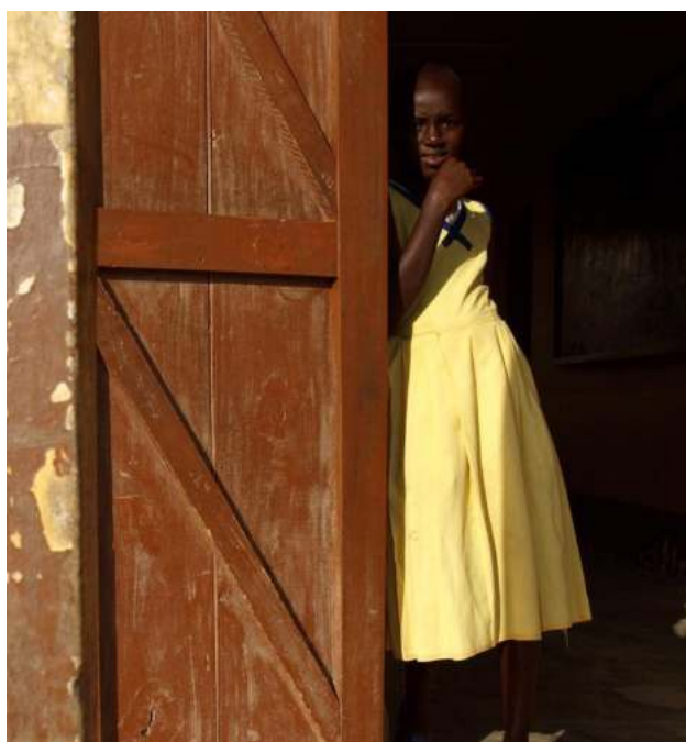
A Northern Ghanaian school girl in her classroom building.