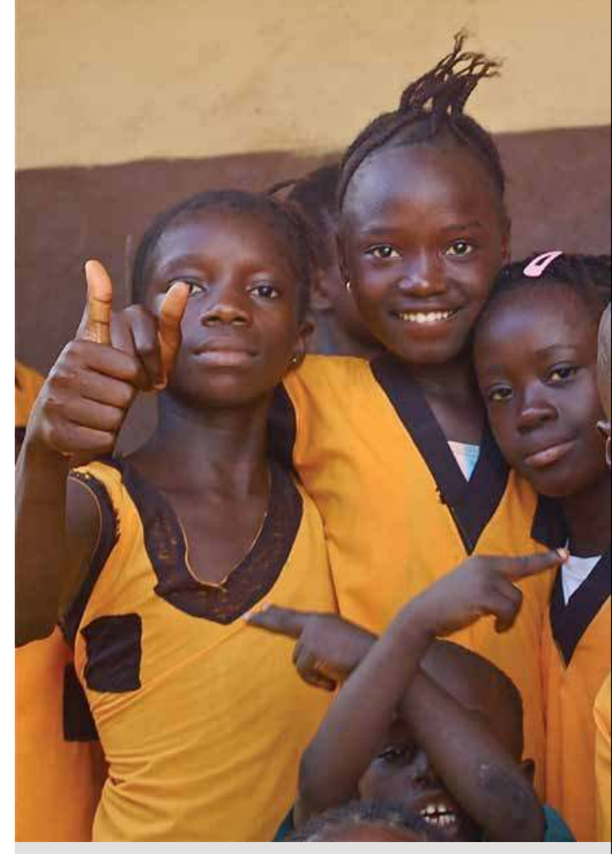
Interviews and group discussions were part of the research in urban Freetown.

Four women from Freetown were involved in the activities as research assistants. All of them had previous experience in research and were fluent in both Krio and English. In preparation for data collection, the research assistants participated in a three-day training workshop that provided a broad understanding of WASH and menstruation, methods and techniques in qualitative data collection, and research ethics.