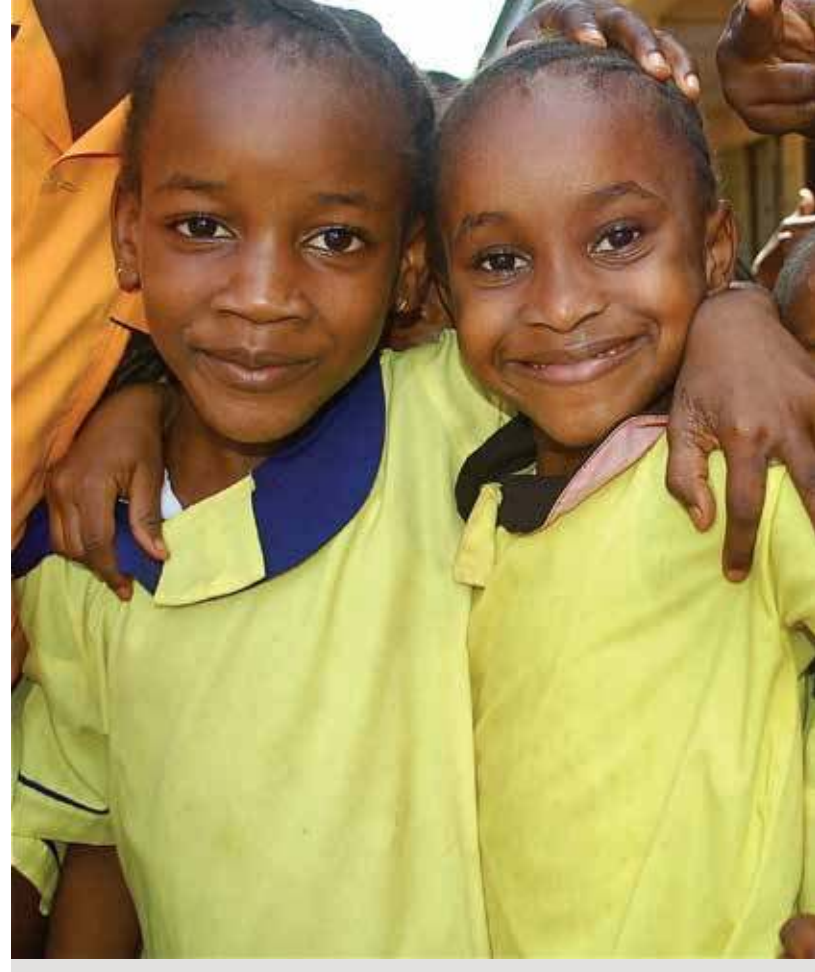
A girl's age at menarche varies according to biological and socio-economic factors. This study emphasizes the importance of teaching girls about menstruation before they have their first period.

Occasionally, girls would link the act of menstruation with future childbearing. They stated that women and girls menstruate so that they are able to have children, or that not menstruating meant a woman was unable to bear children. But the biological reasons or how menstruation was linked to having children were often unknown. The most common menstruation-to-childbearing link that girl expressed was the belief that sex during menstruation would lead to pregnancy. Few girls knew that sex in general could lead to pregnancy now that they had reached menarche.